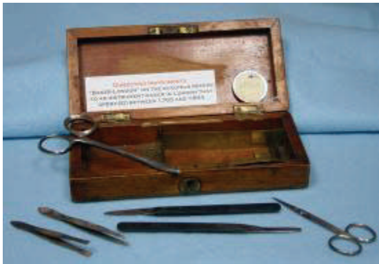
Early 19th century dissection kit

The Archives of the HRC accepts donations of artifacts because medicine is, in a very special way, very instrument oriented. Artifacts help illustrate the history of medicine in a way that words sometimes cannot do. While the HRC's collection of artifacts plays a major part in the upkeep of the four exhibit areas monitored by the HRC, there are times when a closer, but not necessarily "personal" look is needed.