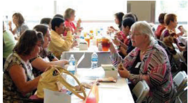
Educators networked during lunch.

Turning Point Technologies shows their audience response system to educators at the symposium.