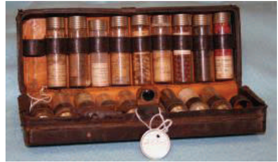
Physician's pocket medicine case, early 19th century