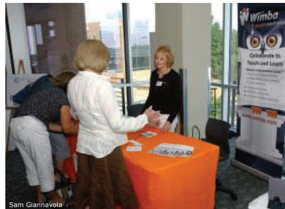
One of the products in the exhibit area was Wimba.

This year's theme was Extreme Makeover: Course Edition . Thursday's symposium consisted of a morning filled with idea sharing for creative courses. One-hour break out sessions in the afternoon showcased some of technologies available. Topics included Podcasting, Wimba, PowerPoint 2007, SoftChalk and other tools used to communicate with learners.