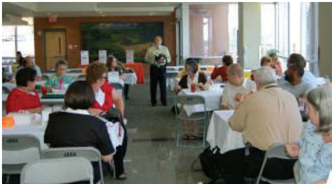
One of the door prizes was a keypad system from Turning Point Technologies.

The Third Annual Teaching with Technology Annual Symposium was held Thursday, July 24 and Friday, July 25, 2008. The symposium was sponsored by the UAMS Teaching with Technology Committee. The UAMS Library played a major role in the planning and supporting of the symposium. The main focus of the symposium was to show educators the various ways to incorporate technology in their educational practices. More than 125 educators, from both K-12 and higher education, attended.