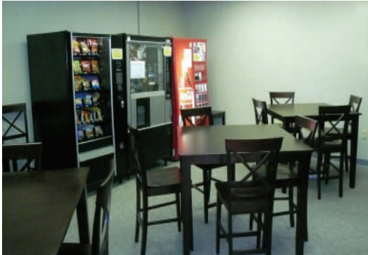
The new Recovery Room Lounge

The glass wall will also enable the Library to provide access for students to the study area in the North half of the first floor when the Library is closed. Students will be able to access the area through the emergency door at the North end of the first floor with a card swipe reader. Only valid UAMS id cards will work with the card swipe which opens the door. There will be no library staff or reference and circulation services available when the Library is closed, and access to the rest of the Library, including the print collections on 2nd and 3rd floors, will not be available, but the vending machine room will be accessible. The estimated completion date for Phase II is August 15th.