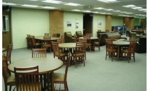
New furniture and seating on the 1st floor

Phase II of the renovation project, which is just getting underway, will address noise, temperature and access issues on the first floor. The center point of Phase II is a glass wall that will separate the noisy front entrance area of the Library from the new study area in the North half of the 1st floor where most computers and the new furniture are located. The glass wall will mimic the wall at the entrance of the Library and will have ADA compliant doors for entry into the study area. The wall should help control noise and provide better temperature control.